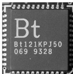
The image used in this code snippet

roi.Attach(&image, 50, 224, 340, 96); // Create an EOCR2 instance EOCR2 ocr2; // Set the required parameters ocr2.SetCharsWidthRange(EIntegerRange(25,25)); ocr2.SetCharsHeight(37); ocr2.SetTopology("[LN]{-0}\nN{3} N{4}"); ocr2.SetTextPolarity(EasyOCR2TextPolarity_WhiteOnBlack); // Add TrueType character to the character database ocr2.AddCharactersToDatabase("C:\\Windows\\Fonts\\calibrib.ttf"); ocr2.AddCharactersToDatabase("C:\\Windows\\Fonts\\yugothb.ttc"); // Read text from the image std::string result = ocr2.Read(roi);