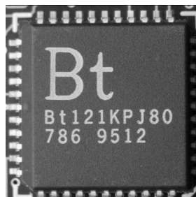
The image used in this code snippet

image.Load("image.tif"); // Attach a ROI to the image EROIBW8 roi; roi.Attach(&image, 50, 224, 340, 96); // Create an EOCR2 instance EOCR2 ocr2; // Set the required parameters ocr2.SetCharsWidthRange(EIntegerRange(25,25)); ocr2.SetCharsHeight(37); ocr2.SetTextPolarity(EasyOCR2TextPolarity_WhiteOnBlack); ocr2.SetTopology(".{-0}\n.{3} .{4}"); // Learn from the reference image: // ↳ Detect the text in the image EOCR2Text text = ocr2.Detect(roi); // 2) Set the true values of the text text.SetText("Bt-2-KPJ80\n786 9512"); // 3) Add the characters to the character database ocr2.Learn(text); // Save the character database ocr2.SaveCharacterDatabase("myDB.o2d"); // Alternatively, save the model file. // This will store the character database and the parameter settings ocr2.Save("myModel.o2m");